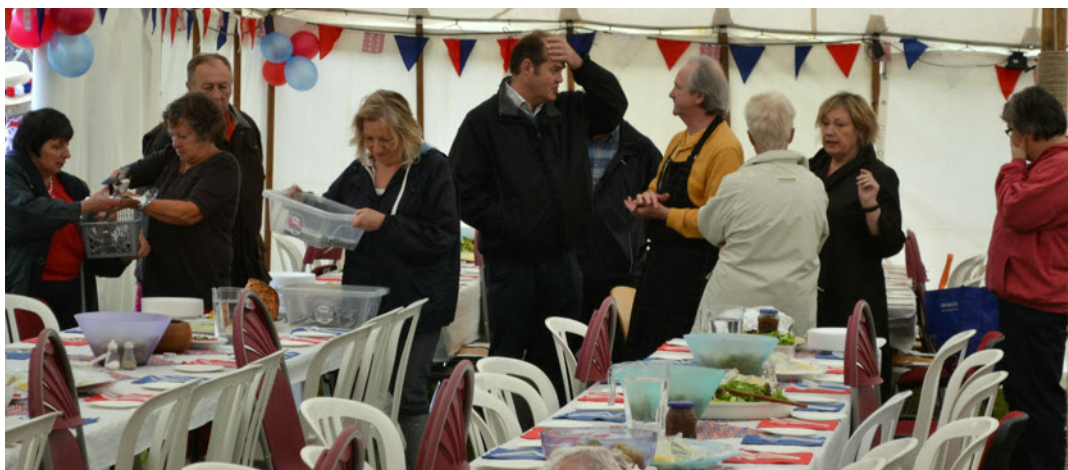
Setting up the marquee for lunch